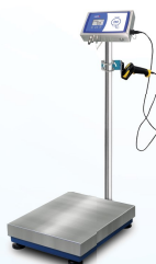
Smart Floor Scale