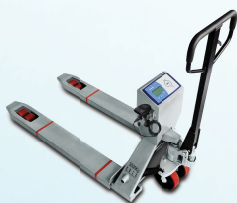
Smart Pallet Truck Scale